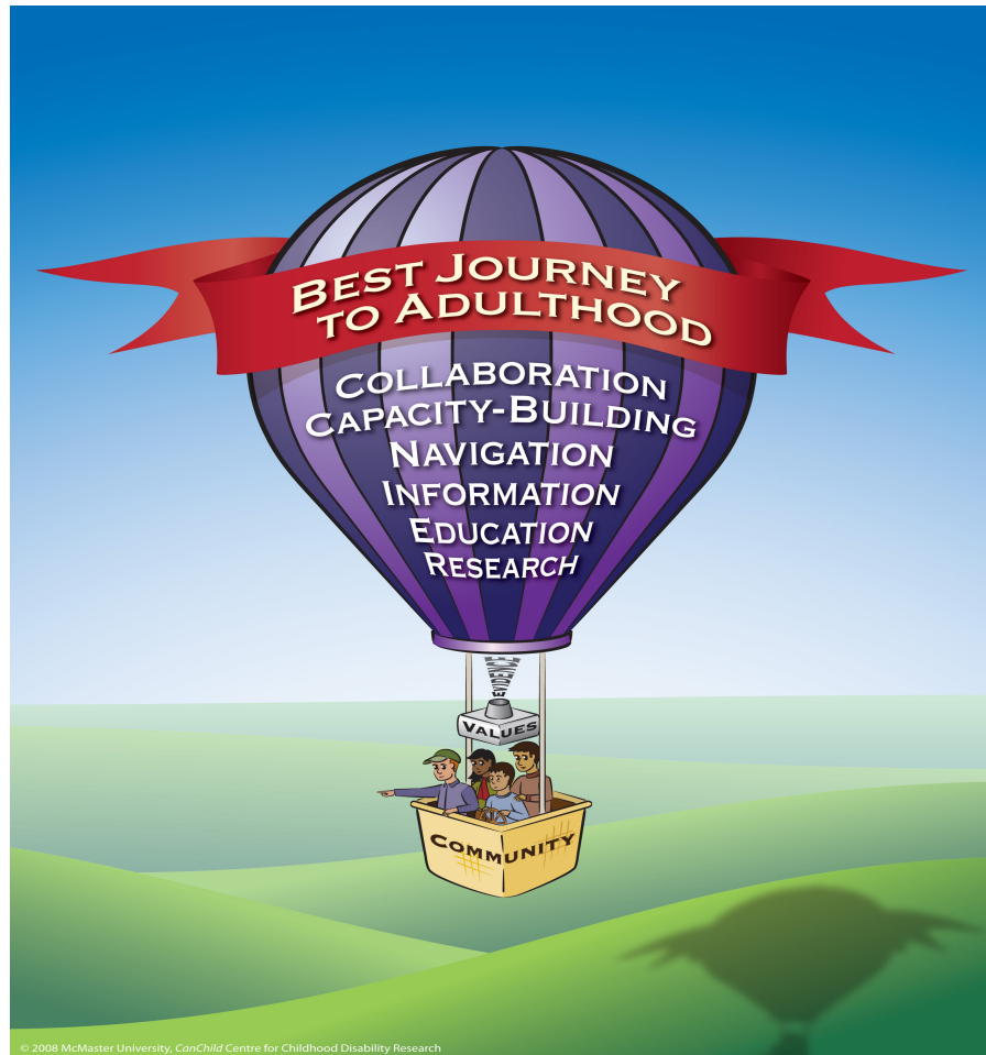
Figure One: BJA Model – Hot Air Balloon (© Copyright 2009 McMaster University).

In the balloon basket, the main people involved in the journey include the youth, parents or guardians, and a navigator. A navigator is a person who provides support and guidance to the youth and family as they navigate along their transition journey. The navigator role is described in detail in Chapter 3 (Theme III). Note that in this basket, the youth is ‘in the driver’s seat’ but is being guided and supported by the navigator and parents. This situation represents the early stages of the transition journey. Later in the journey, the navigator may be less involved in guiding and supporting, and the youth will take more control in directing the balloon’s journey.