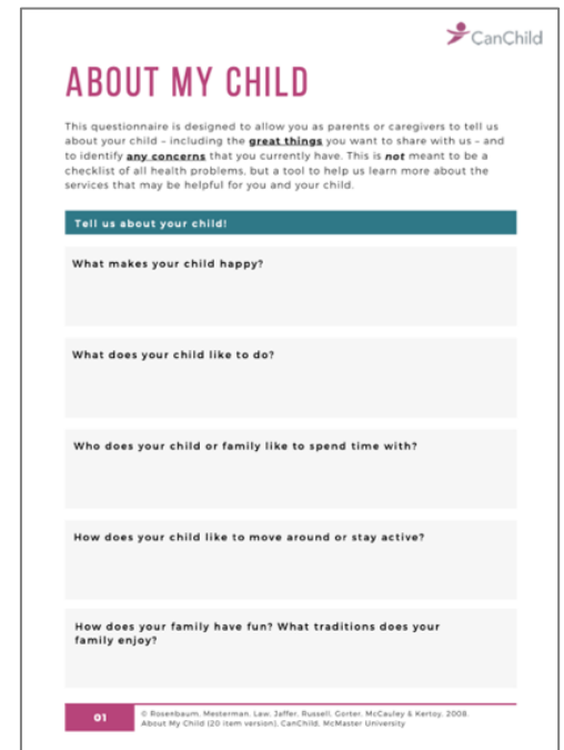
Figure 1: About My Child (first page)